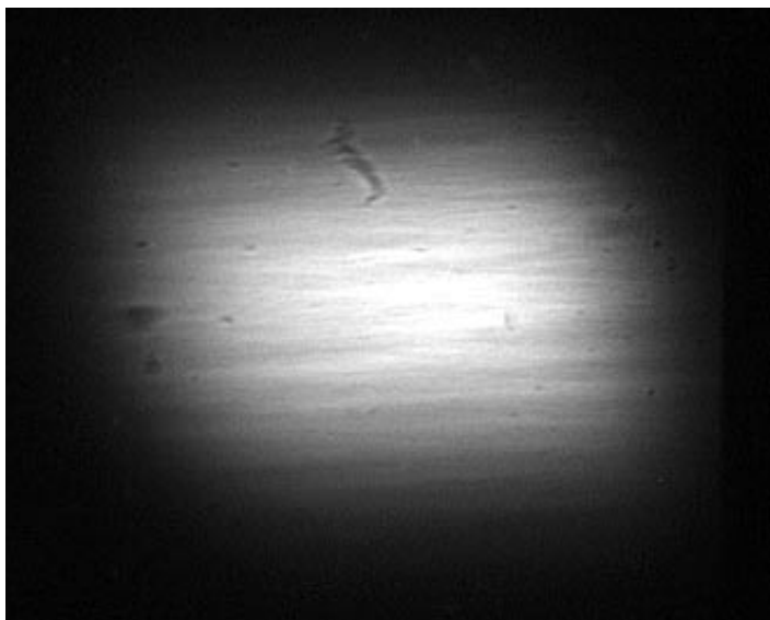
FIG. 2. A monochromatic x-ray beam profile in the 7-ID-C hutch.

ing the average energy of the spectrum towards higher energies. This can be a problem when looking for the reflected beam on a mirror since the low-energy x-rays are absorbed by the filter. We have solved this problem by using visible neutral density filters to reduce the light intensity on the CCD. The TV camera used is the 1/3" CCD Watec 502A or the new Watec LCL-903HS. The new Watec is recommended since it has a higher sensitivity (0.0002 vs 0.05 lux), a higher resolution (570 vs 400 TV lines), and a more robust BNC connection than the 502A.